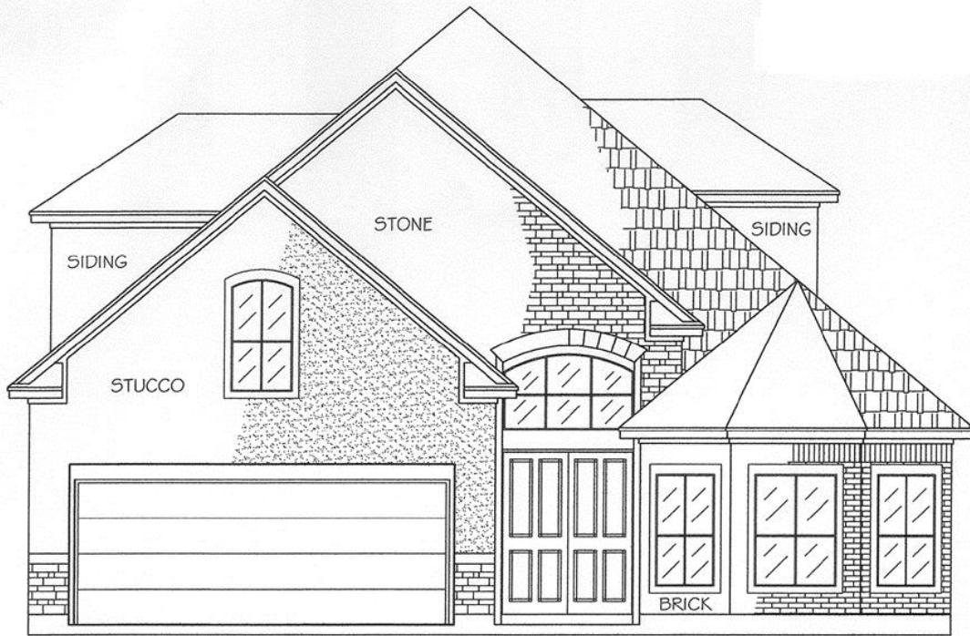
FRONT ELEVATION PLAN No. 2854-1005 3-BEDROOM 2-STORY 2854 SQ. FT. LIVING AREA MONTE SMITH DESIGNS COPYRIGHT 2007