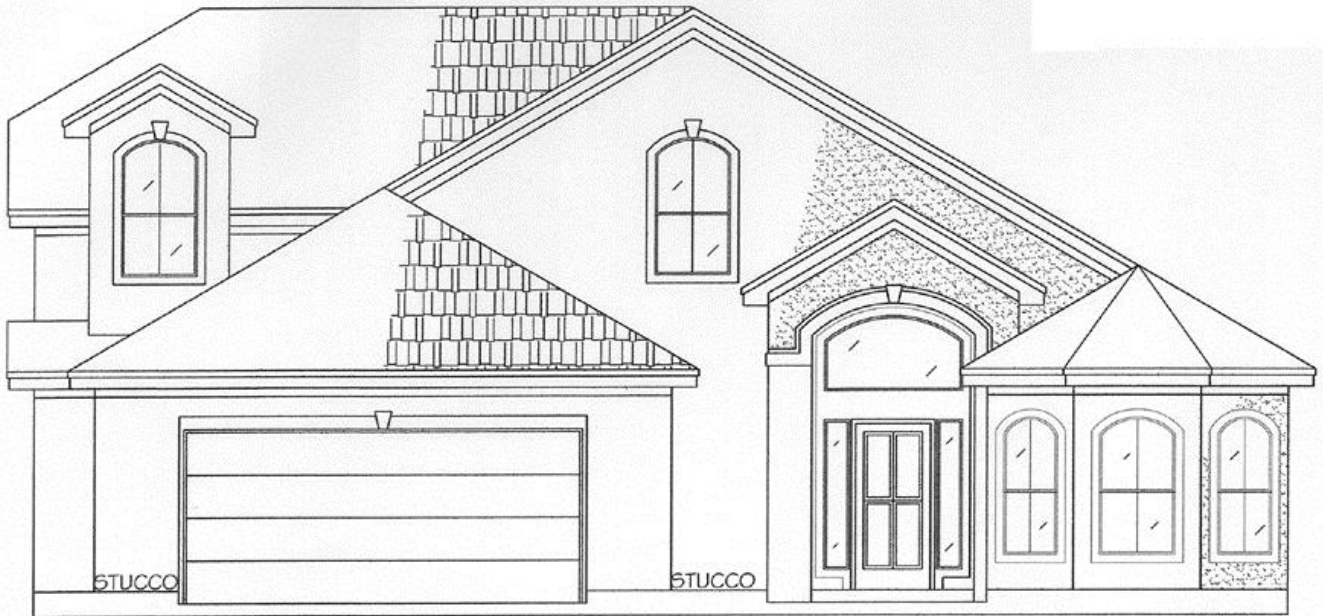
FRONT ELEVATION PLAN No. 2748-0203 4-BEDROOM | 1 1/2-STORY 2848 SQ. FT. LIVING AREA MONTE SMITH DESIGNS COPYRIGHT 2007