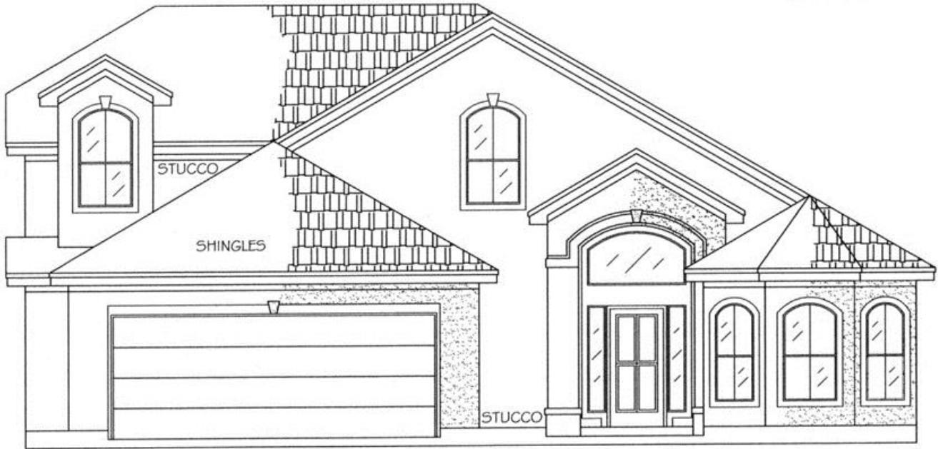
FRONT ELEVATION PLAN No. 2727-0203 4-BEDROOM 2-STORY 2727 SQ. FT. LIVING AREA MONTE SMITH DESIGNS COPYRIGHT 2007